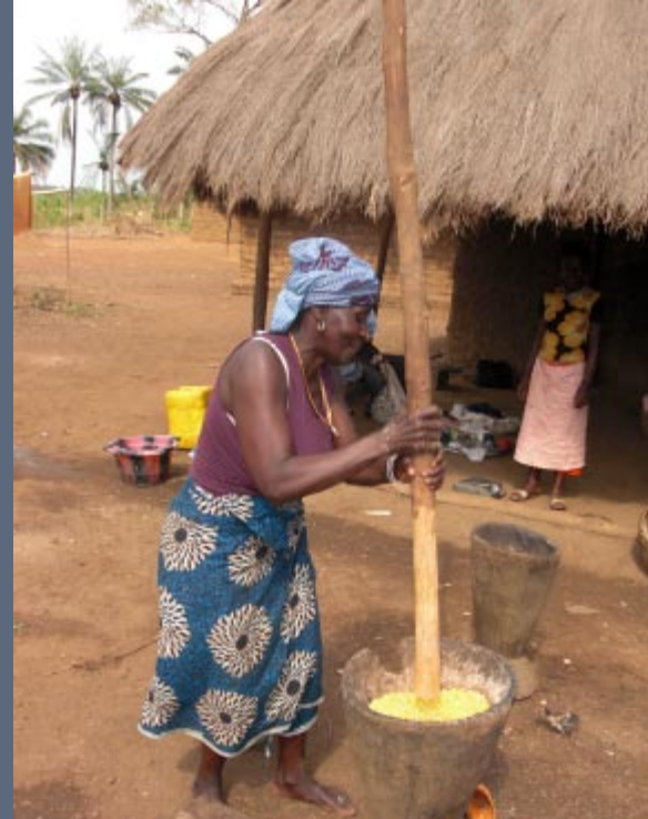
Working to feed the family

Friendship and fun however still have a central role to play in our relationships, and our visiting partners, housed in Sheffield University halls of residence had time and opportunity to socialise with us and each other in their two week visit. An external facilitator ran the programme and led a partner driven evaluation of Village Aid's performance. ■