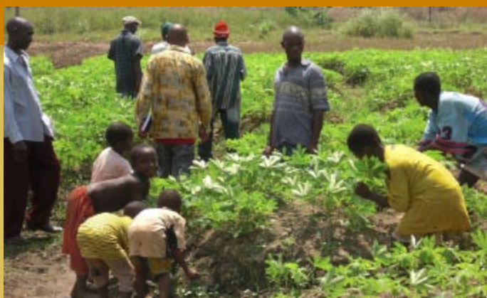
Community gardens create livelihoods and are an opportunity to gain skills

She is strong, resourceful and full of hope. The future rests on her shoulders. ■