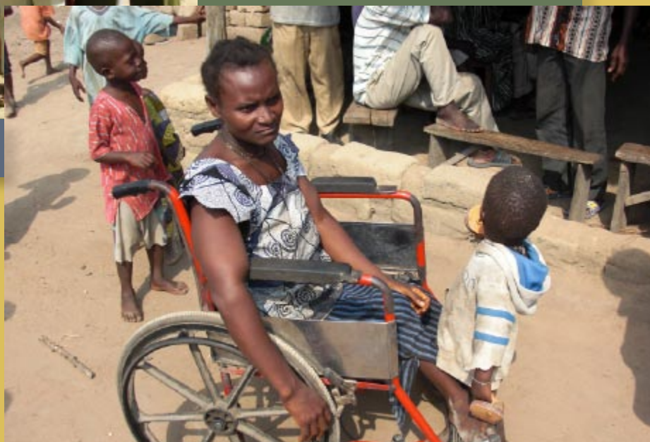
Good governance can help to overcome injustice for groups suffering discrimination