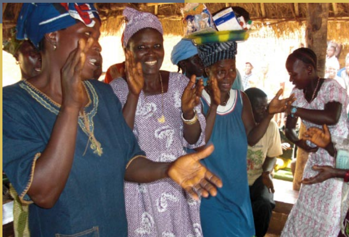
Friendship and fun have a central role in our partnerships

“ Village Aid believes strongly in the autonomy of our partners and their right to self determination ”