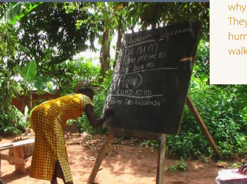
Adult learning under-pins our work