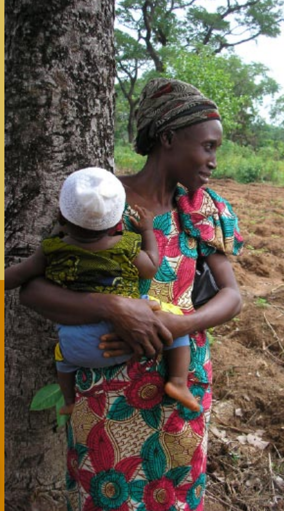
Village Aid has enabled many widows to gain access to their land