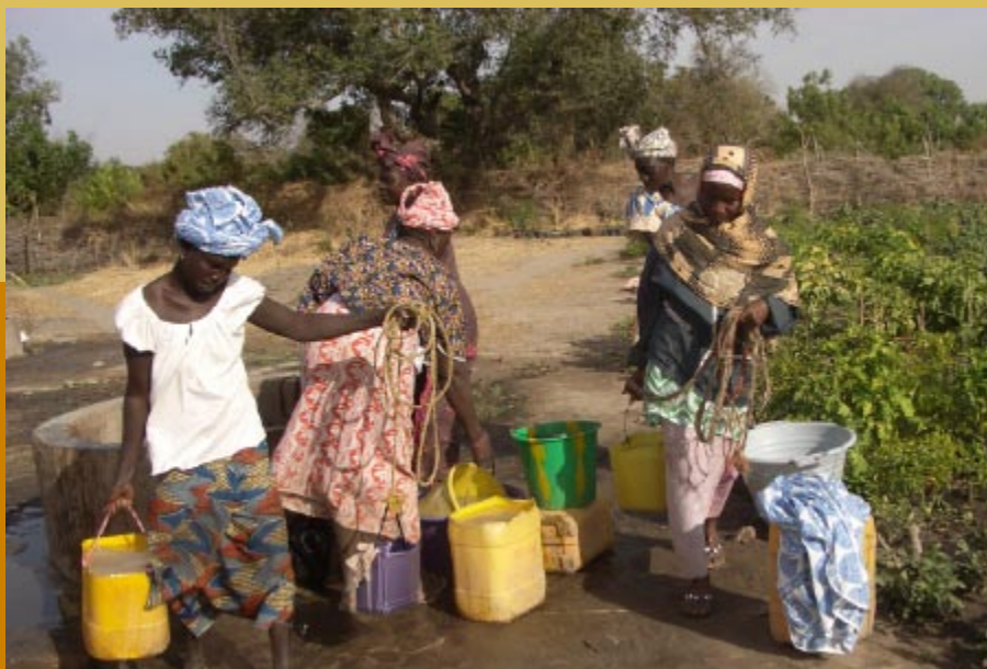
Watering the organic gardens in The Gambia

for access to land and water. Forests for their future.