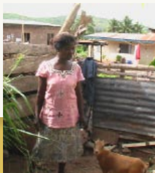
Young women entrepreneurs helped by Drama Network in Ghana's Eastern region

Enterprise development, using small group loans to start up business has been a success also in Cameroon, where we continue to work in partnership with Comic Relief and Mboscuda NorthWest.